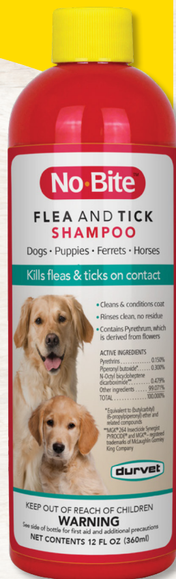
Flea and Tick Shampoo

Flea and tick control on the animal is only part of the solution to the problem. The inside of the house and the outdoor area used by the animal must also be treated for complete control. See label for complete directions and precautions.