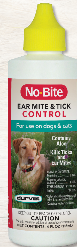
Ear Mite & Tick

Apply 5 drops into each ear twice daily until ticks and mites are eliminated. Do not allow children to apply this product. Use other EPA approved products for treatment of mites and ticks outside the ear.